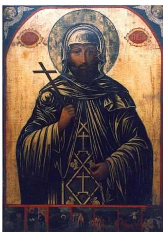
TROPARION – Tone 8

The Monastery of Saint Demetrios, Basarabov, was founded over the cave where Saint Dimitrios the New lived his ascetic life. The Monastery is near Basarabov. The village of Basarabov, initially located 3-4 km from the river Danube, was moved to Ivanovo, near the cave where Saint Demetrios lived. Located in the picturesque valley of the Lom river, the Basarabov Monastery, is the only monastery in Bulgaria carved in the rock and inhabited since its establishment. St Demetrios is commemorated on 27 October.