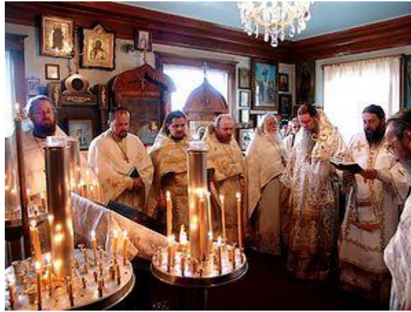
St. Tikhon of Zadonsk parish